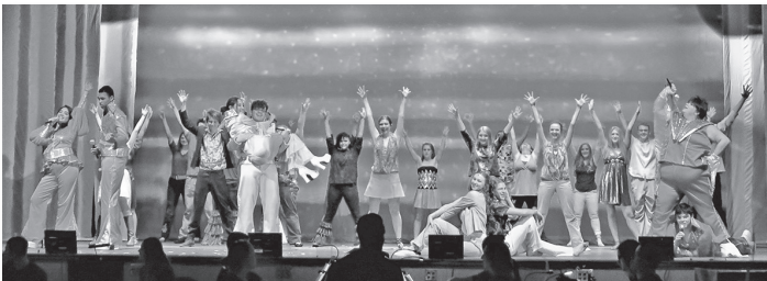
The Middle/High School Theatre Department staged its production of the musical "Mamma Mia!" in March. Around 1,770 tickets were sold for the show. Tonawanda's production is one of 10 finalists for the 2019 Western New York Kenny Awards.

A: The District is required to remove any expenses attributed to public use of school buildings and grounds, student supplies, non-contracted salary, non-mandated instructional programs and staff, new equipment, nonessential maintenance, capital expenditures, and budget support of school cafeteria programs.